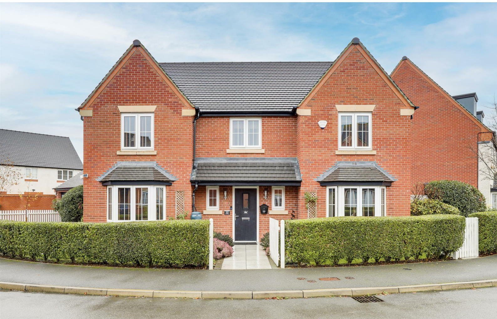
Barnard Drive, Boulton Moor, Derbyshire DE24 5BU